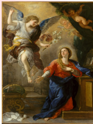
The Annunciation by Luca Giordano