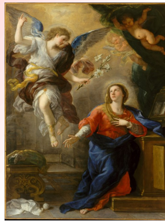
The Annunciation by Luca Giordano