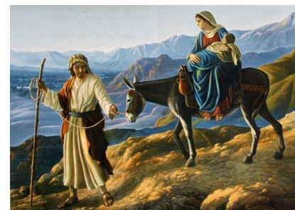
Flight to Egypt