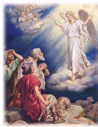
Angels visit the Shepherds