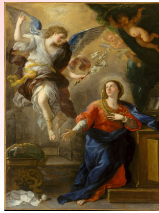
The Annunciation by Luca Giordano