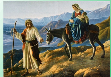
Flight to Egypt

For more information on Pro-Life Activities