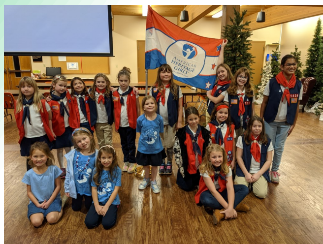
American Heritage Girls Troop, Seton Parish