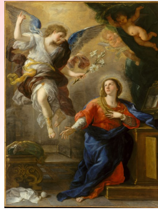
The Annunciation by Luca Giordano