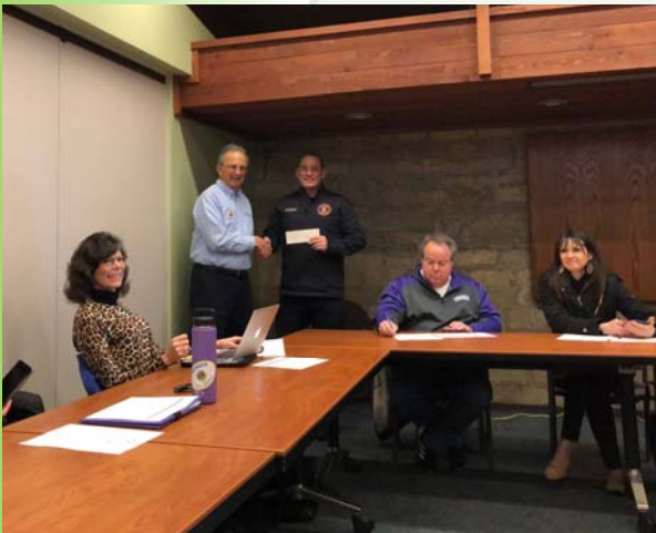
Knights donation to PARC for emergency bags for shut-ins

This is a limited time offer, so please take advantage