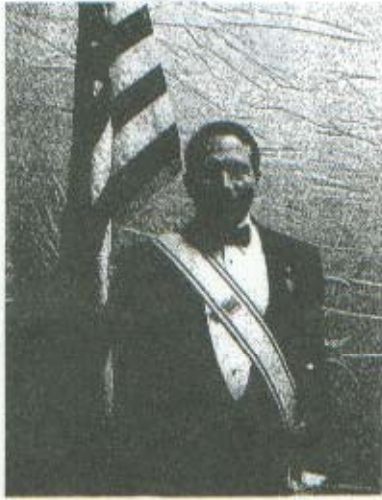
Sir Edd Chinnock