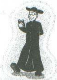
I wonder if we made the newest issue of Priest's GQ?